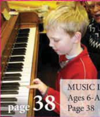
MUSIC LESSONS Ages 6-Adult Page 38