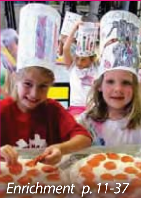
Enrichment p. 11-37