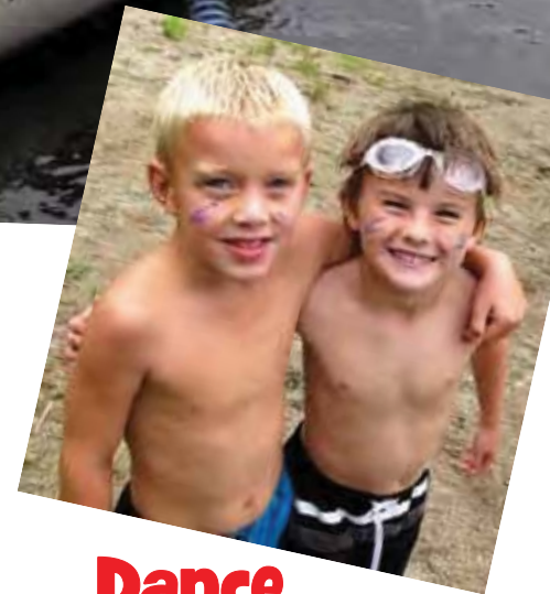
Dance Classes p. 38