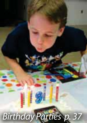
Birthday Parties p. 37