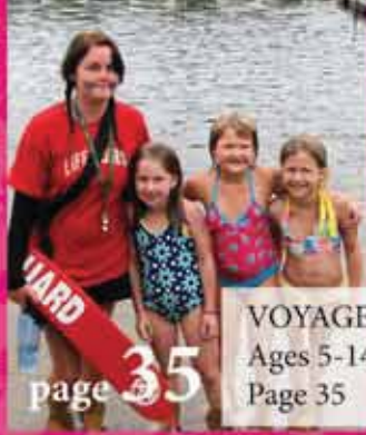
VOYAGEUR CAMPS Ages 5-14 Page 35