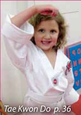
Tae Kwon Do p. 36