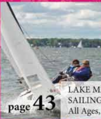
LAKE MINNETONKA SAILING SCHOOL All Ages, Page 43