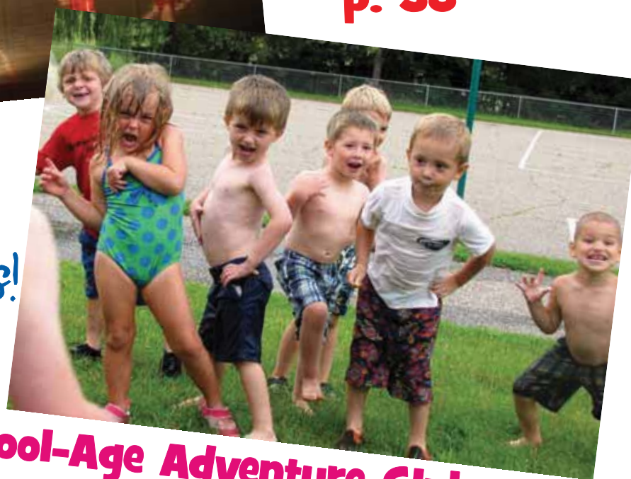
Preschool-Age Adventure Club p. 7