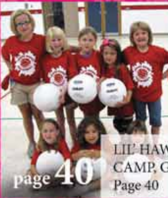
LIL' HAWKS VOLLEYBALL CAMP, Grades 1-3 Page 40