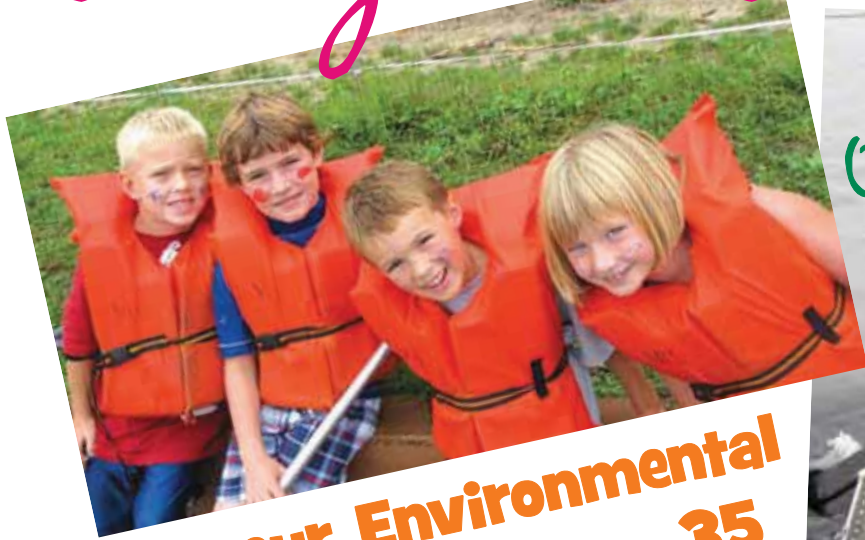
Voyageur Environmental Center Camps - p. 35