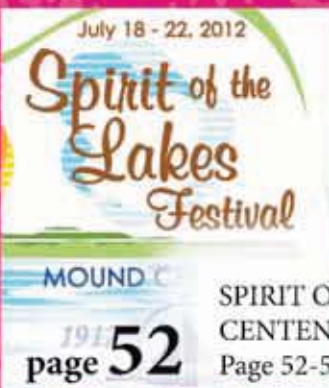
SPRIT OF THE LAKES / CENTENNIAL Page 52-53