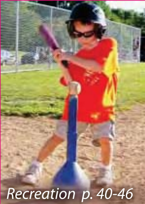
Recreation p. 40-46