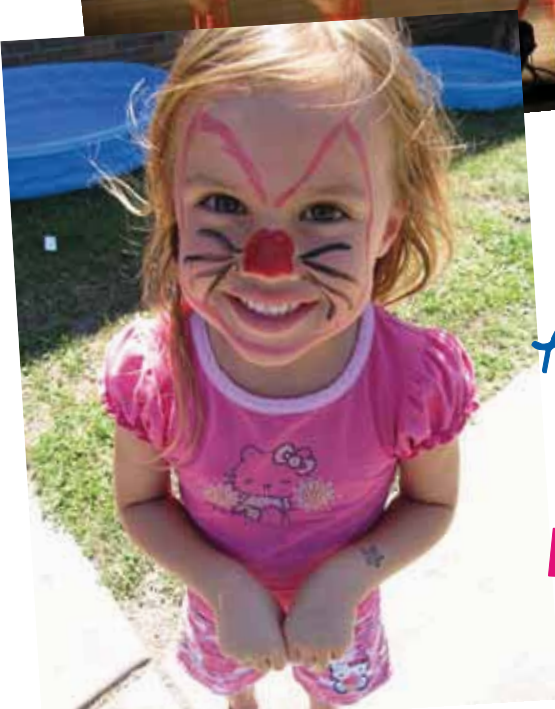
Fun with friends!